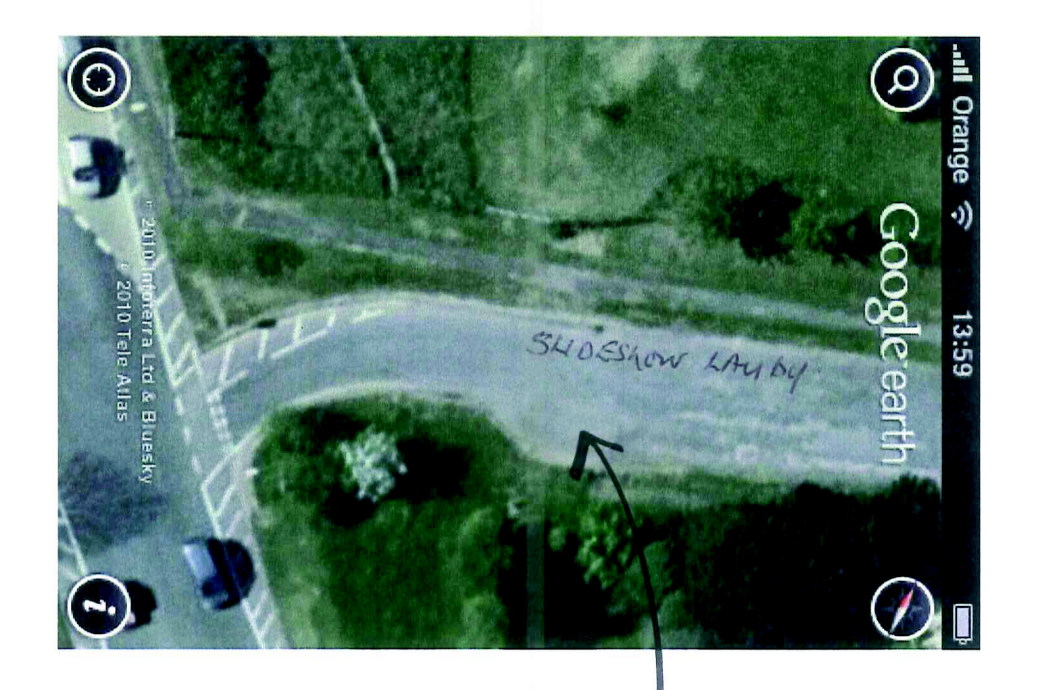
SOFA TO A